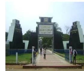
ARINGAR ANNA ZOOLOGICAL PARK