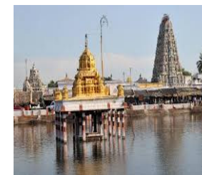
THIRUPORUR MURUGAN TEMPLE

Sponsorships Invited from Industries/ Organizations/ Institutions